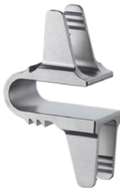
Figure 1: coflex® Interlaminar Technology

To properly fit into the space between the spinous processes in a range of patient anatomies, the coflex® implant is manufactured in five sizes: 8, 10, 12, 14 and 16mm. The size corresponds to the size of the “U” as measured from opposing long arms. The number of teeth and the dimensions of the teeth are the same for all device sizes. The “gap” between the upper and lower arms of the “U” is 5mm for the size 8 device, 7mm for the size 10, 9mm for the size 12, 11mm for the size 14, and 13mm for the size 16.